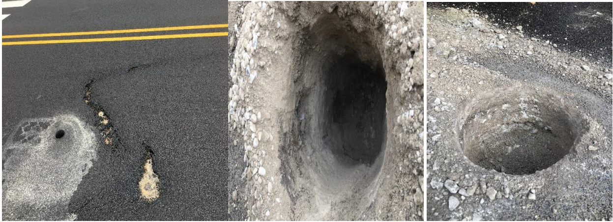
Fig 5: Sample cores drilled at the failure location