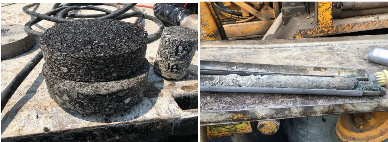
Fig 7: Core samples for bitumen content and split spoon sample for crushed stone moisture percentage

To figure out the reason for the rutting, bond failure, and the water clog on the surface, sample cores were tested for percentage of bitumen and split spoon samples were drilled and collected to see the crushed stone moisture percentage.