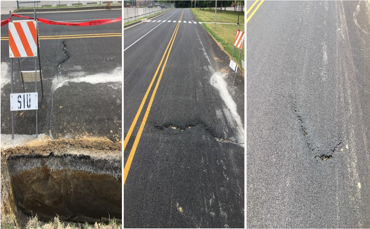
Fig 3: Rutting of the Saluki Drive Pavement

The saluki drive pavement showcased the rutting phenomena, in less than a month from when it was laid. As discussed in the literature, the causes of rutting may depend on various factors, proper investigation and the extent of the issue, can lead to a better solution. The following are the pictures explaining the failure of the pavement.