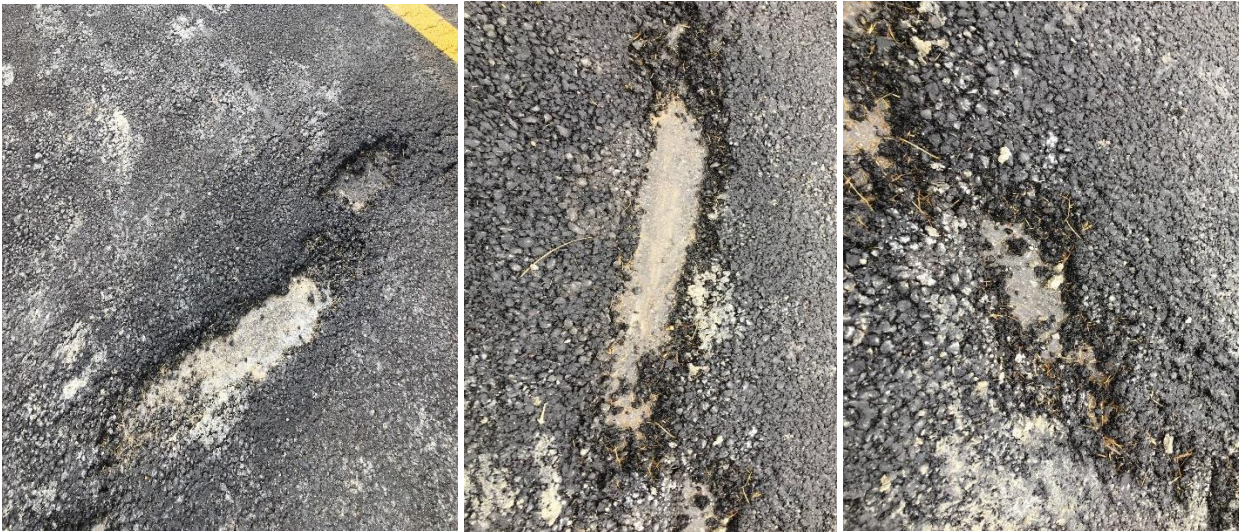
Fig 4: No proper bonding between the layers of the asphalt pavement