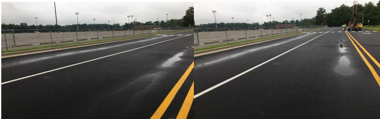
Fig 6: Water clog on the surface, due to inadequate drainage