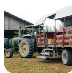
Farms and Ranches