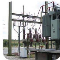
Power Transmission and Distribution