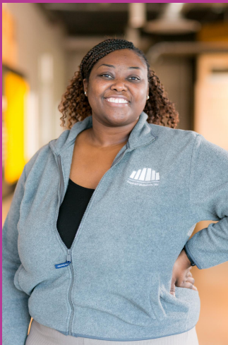
Meet ZaKavia @Asphalt Materials, Inc.